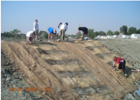
Laying down, and stapling erosion control jute matting.