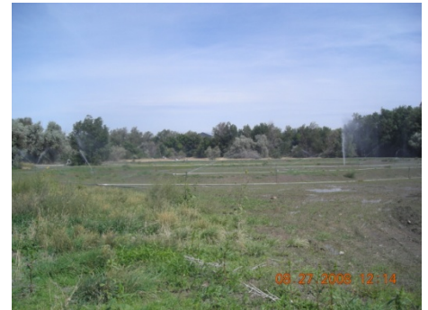
This project was seeded in July, necessitating irrigation until mid-October.