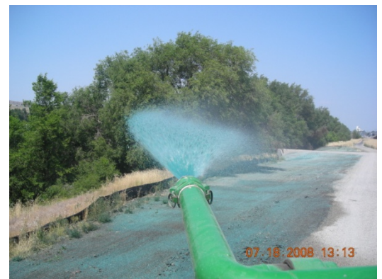
Applying hydromulch and seed with a hydromulcher.